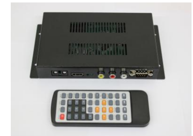
Metal housing (Optional)